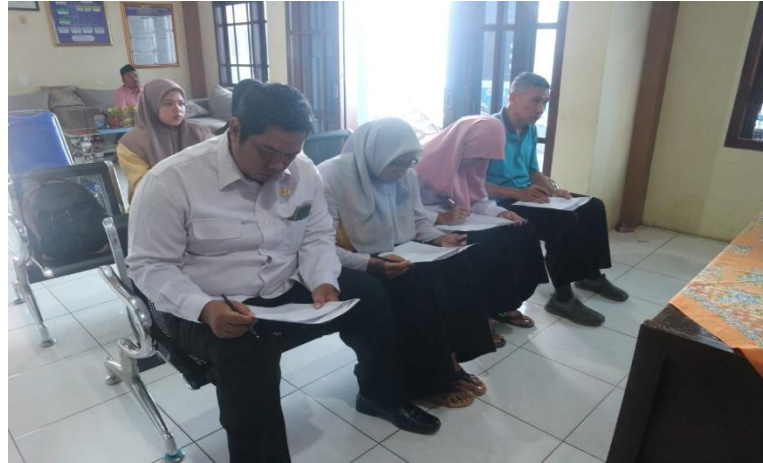
Figure 4. Pretest Filling Related to the Website

In the second session, namely the implementation of the program, the Information Media Team was immediately guided in making Google forms and procedures for entering information into the Website along with the language of making information, because this is important to provide information as a form of public service to the community.