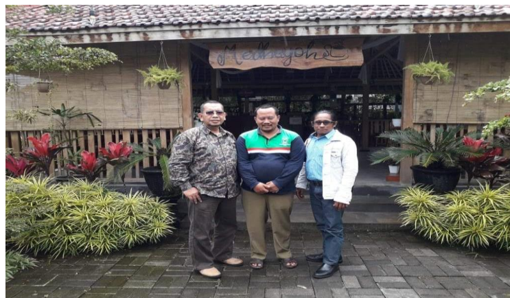
Figure 1. Coordination and establishing agreements.

The partners who are part of this series of service activities are the part that holds the informatics system in Sukopuro Village, before this activity was carried out a team of lecturers and students of Wisnuwardhana University Malang from the Faculty of Law and the Faculty of Teacher Training and Education coordinated with the Sukopuro Village Government.