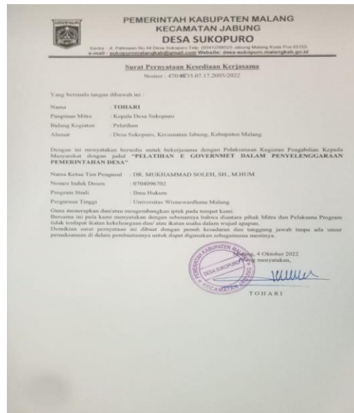
Figure 2. Willingness as a partner.