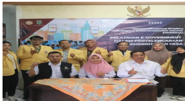
Figure 3. Opening of Community Service "Website Training"

This activity will be held on Wednesday, February 1, 2023, at the Sukopuro Village Hall. It is clear that these actions have a beneficial impact and generate positive responses from the Village because it increases knowledge and ability in organizing the web and making Google forms as a means of accommodating community participation in village development, in the context of implementing the Sukopuro Village Government E-Government.