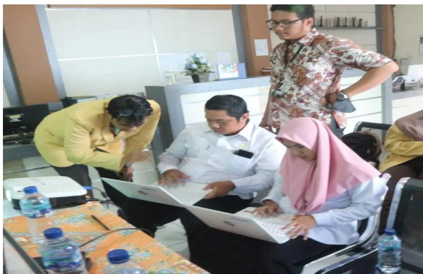
Figure 5. Implementation of Community Service "Website Training"

Making Google Forms also provides benefits to receive all forms of information from the community related to conditions, potentials, and things that happen around to get two-way information and the Sukopuro Village Government E-Government can be managed properly, all portals on the website are filled, so that the promotion and information on the implementation of village government are expected to run well as well, which in the end, will make it easier to introduce potentials, as well as the administration of public services in Sukopuro Village. With the Sukopuro Village Government website which is well-filled with all existing portals, it can optimize the delivery of information on the implementation of village government and the potentials of the village.