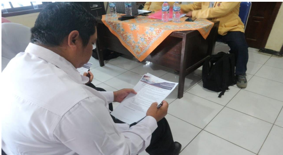
Figure 7. Implementation of posttest work,

The third session which is the last session is posttest work, to find out the results of this service activity. This activity is very interesting because the village apparatus in charge of the website from Sukopuro Village gained new experience and skills in the use of Information technology media.