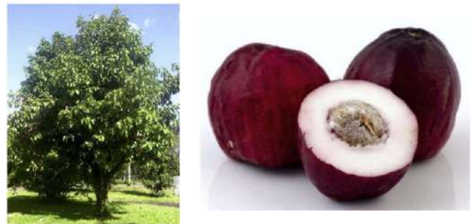
Figure 1. Tree (1a) and fruit (1b) Syzygium malaccense

Agustina, et al (2010) reported in her study, 8.05% consists of rind and fiber-rich (9.34 g.100 g-1), vitamin C (292.59 mg.100 g-1), and anthocyanin (300.54 mg.100 g-1 skin). The pH value of 3.5 allows it to be categorized as a highly acidic food and suitable for jam, or juice to improve the crops. Syzygium malaccense shows a physical characteristic that make it industrial for fresh fruit, juices, jams, nectar and ice cream, and its skin shows a physical and chemical property that allow it to be used as a food and dye antioxidants and also to enrich diet. Based on these, by knowing the potential of Rose Apple fruit with Syzygium malaccense in Jombang Regency, it will help to increase the selling value and increase the economic value for the rose apple farmers.