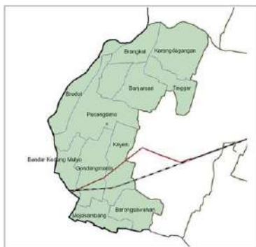
Figure 2. Map of Bandar Kedung Mulyo Subdistrict

Bandar Kedungmulyo sub-district has a very strategic location, because it is located in the west-central part of Jombang regency and crossed the main road of Surabaya-Madiun. The area is bordered with Perak sub-district in the east, Kediri in the east, Nganjuk in the west, and Megaluh in the north. Geographically, Bandar Kedungmulyo sub-district is located between 1120 06' 37" west longitude to 1120 10' 30" east longitude and 070 31 '39 " north latitude and 070 36' 49" south latitude, with an area of 32.49 km 2 . With an area of 3,250 ha, Bandar Kedung Mulyo district is a lowland with altitude <700 m above sea level which has slope <8%. It has a hot soil temperature regime ( Isohyperthermic ) and a wet moisture regime ( aquic ) if it is administered. The climate condition in the area is moderate with 3-4 months monsoon and 5-6 months of dry season. In general, Bandar Kedung Mulyo district has a great potential for agricultural development.